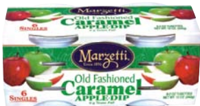
Current Marzetti Caramel Packaging

Must be postmarked by 12/1/09 for receipt by 12/7/09. No C.O.D.s will be accepted. SUBJECT TO Official RULES at www.udipsweepstakes.com . BE CREATIVE IN DEVELOPING YOUR PACKAGE DESIGN. Magic marker, crayon, paint, ink, pencil or any like writing instrument may be used to draw and/or color your design. Be sure to place design in a sandwich bag (or to otherwise carefully package it) so that the design is not damaged during shipment. Limit of (1) entry per child or other person. A parent/legal guardian may (but is NOT required to) enter one (1) design for him/herself in addition to one (1) design for his/her child (or, one (1) design for each of his/her children, as appropriate). If submitting more than one (1) entry in accordance with these Official Rules, each entry must be mailed separately.